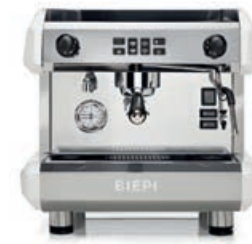
1 GROUP - WHITE / STAINLESS STEEL

The MC-E coffee machine is available as one or two group. Available in two colours.