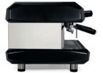
2 GROUP - WHITE / STAINLESS STEEL